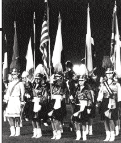
Vasella Musketeers, July 25, 1964.

In 1959, Vasella competed for the first time on the field and shocked the local drum