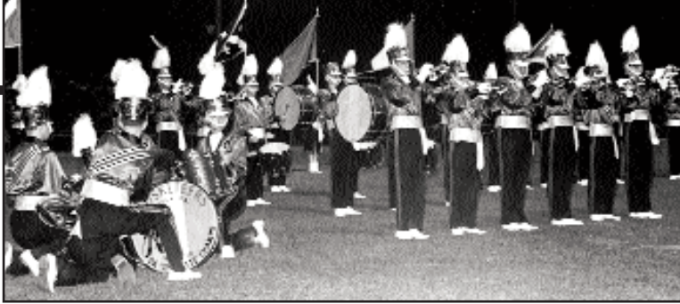
Vasella Musketeers, July 18, 1964 (photo by Moe Knox from the collection of Drum Corps World).

The 1964 season marked their acceptance on the national scene. Under drum major Jerry Powel, the corps made VFW Finals in Cleveland, OH, as well as tying for first in drums at prelims. Along the way, they beat